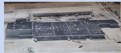
Guthrie High School 1967

Charter Oak Elementary is currently at 94% capacity. This proposal will add room for an additional 150 students.