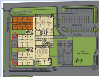
Guthrie High School 2024

Cotteral Elementary is currently at over 100% capacity. The new building will make room for 150 more students. The proposed addition will add room for another 100.