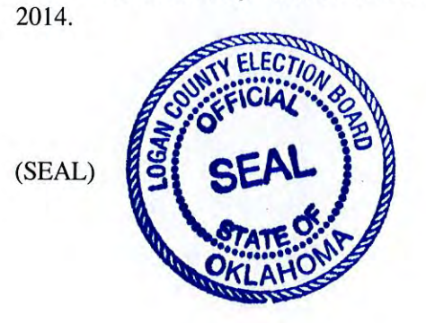
Logan County Election Board

WITNESS my hand and seal of the County Election Board of said County this 15^{th} day of August,